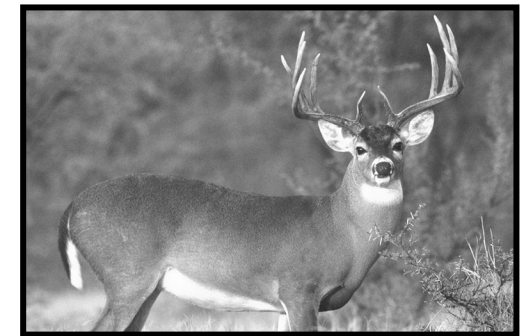
White-tailed Deer: Buck