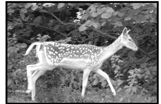
Fallow Deer: Doe